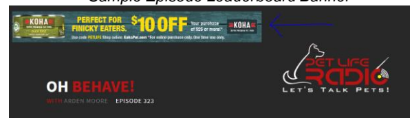
Sample Episode Leaderboard Banner